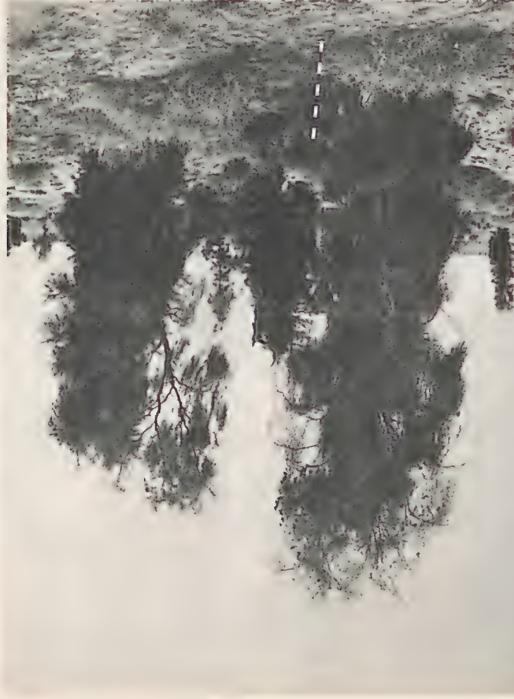
Fig. 2. Acacia peuce near Birdsville.